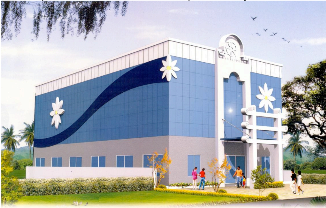
MAHABODHI KARUNA MEDICAL CENTRE