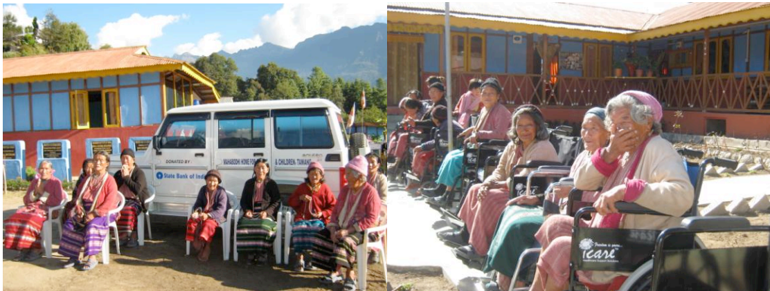
Mahabodhi Home for Elders in Tawang

Census 2001 has revealed that over 21 million people in India are suffering from one or the other kind of disability. This is equivalent to 2.1% of the population. If social disabilities are taken into account the number will go to double digits. Among the five types of disabilities on which data has been collected, disability in seeing at 48.5% emerges as the top category. Others in sequence are: in movement (27.9%), Mental (10.3%), in speech (7.5%), and in hearing (5.8%). Disability due to burns is also high in India. In Bengaluru alone 360 persons lost their lives and 2517 persons needed hospitalization for burn injuries during the last year.