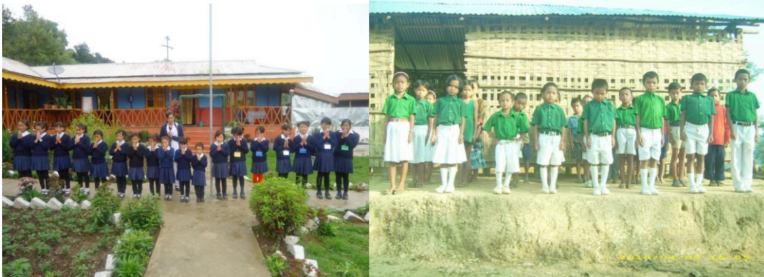
Many poor children are under the care of Mahabodhi residential schools

The normal causes for disability are Arthritis, Cardio-respiratory diseases, Medical/surgical intervention, Burns, Stroke, Leprosy, Cerebral Palsy, Old age, Injury other than burns, polio and others.