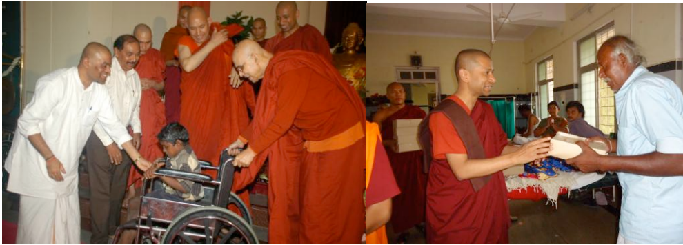
Donation of Wheel Chairs and Regular Hospital Visits by monks

Due to a combination of poverty and absence of a rehabilitation tradition, the field of rehabilitation is very underdeveloped in India. As a general rule for developing countries, the WHO estimates that only 1-2% of patients who need rehabilitation actually has access to it.